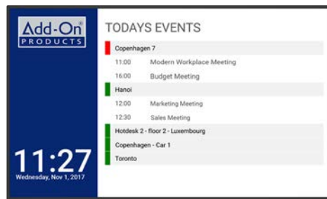
VL800 | 49" Meeting Directory Display