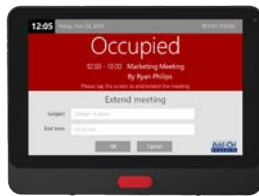
DS-1050 | 10"