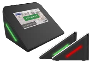
WS-0350 | 4" Workspace Booking Display

We offer a wider selection of displays. See a selection of our desk booking displays and meeting directory displays below.