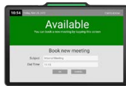
DS-1060 Slim | 10"

We offer a wider selection of displays. See a selection of our desk booking displays and meeting directory displays below.